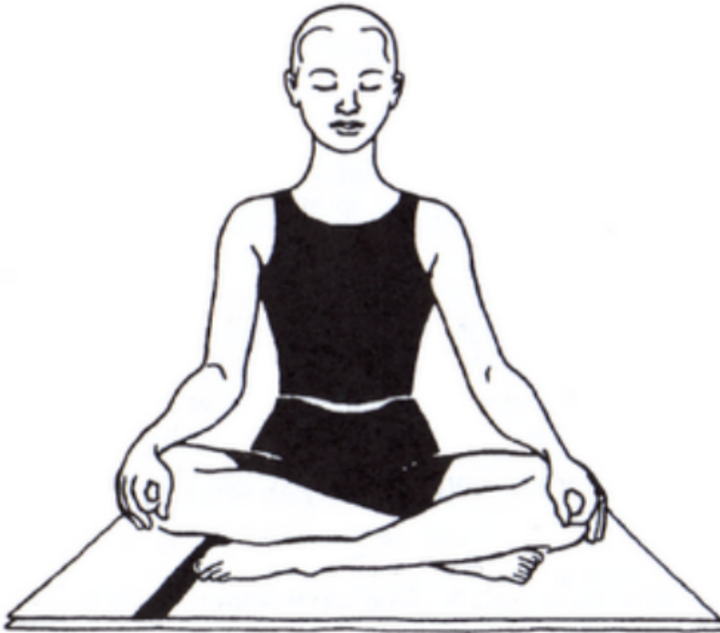
Sukhasana (happiness pose)

In this posture (image 2), people's feet are below the thighs as shown in the above figure. The left foot is below the right thigh and the right foot is below the left thigh. This posture is easier so you can begin with it. You may have to shift weight from one leg to another as sitting in this pose for longer durations may cause discomfort. Also, blood circulation to the legs is affected so take care of releasing the stress by moving and adjusting your feet at regular intervals.